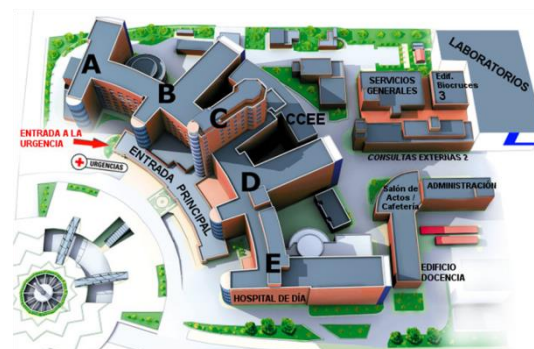
Fig. 1- Complex hospital facilities to act in crisis situations

Through an analysis aimed at identifying and classifying the risks and threats, these economic sectors determine the Internal and External Emergency Plans whose manuals contain all the information necessary to control each type of emergency within the public facility and commercial areas that may be affected.