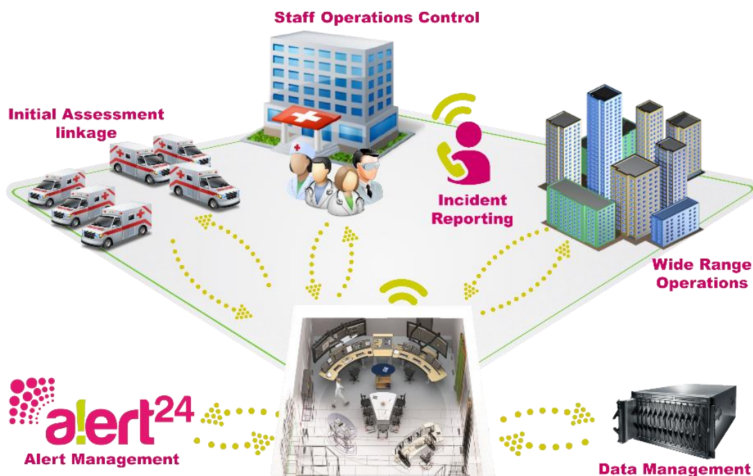
Fig. 2- ALERT24 Integration in the hospital's emergency plans

A hospital is particularly sensitive to any situation that threatens its energy or water supply, in the event of acts of nature (earthquakes, fires, etc.) that endanger the integrity of the building and the lives of patients, as well as that of the staff. In the repositories of chemical substances for hospital use there is a high degree of risk of leakage, explosions, pollution, etc. These being some of the main threats.